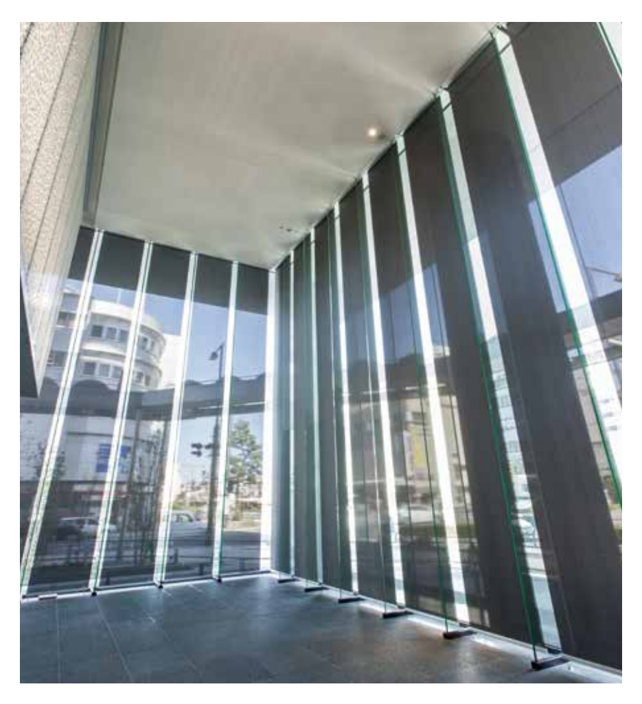
The Hyakugo Bank, Ltd Marunouchi Headquarters Building