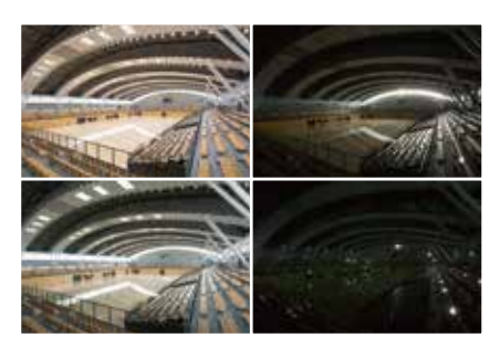
Industry & Sports Center of Tsu City, Saorina

Both small and large rooms can be in complete darkness. Even can not see your own hands!